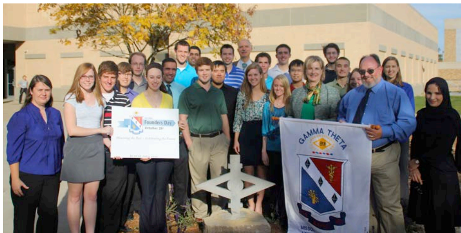
Gamma Theta Chapter at Founders Day

NON-IEEE AWARDS: Missouri School Boards Association Recognitions: 50 th Anniversary Board Member Recognition, 2008 Advanced Board Member Certification, 2007. Missouri S&T: Academy of ECE, Elected 2013; Distinguished Advisor (as HKN Chapter Advisor) , 2015; Faculty Service, 2010; Transfer Advisor, 2007; Faculty Excellence, 2000; Advising, 1999, & Teaching, 2002 & 1995. ASEE Midwest Section Service, 2012.